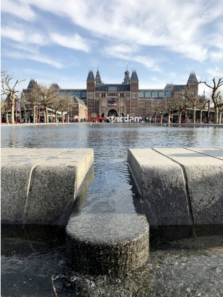
Rijksmuseum and the I Amsterdam Sign