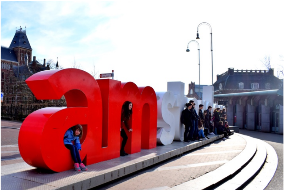
The other side with everyone else