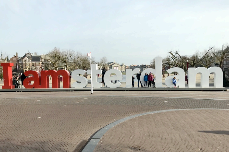
Inverted photo where we have the sign all to ourselves