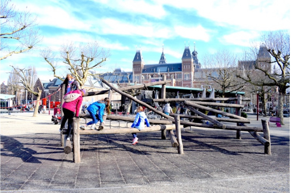
Playground in Museumplein

After touring the museum or before entering, soak in the beautiful views of Museumplein while the kiddos get their wiggles out at the playground near the I Amsterdam sign.