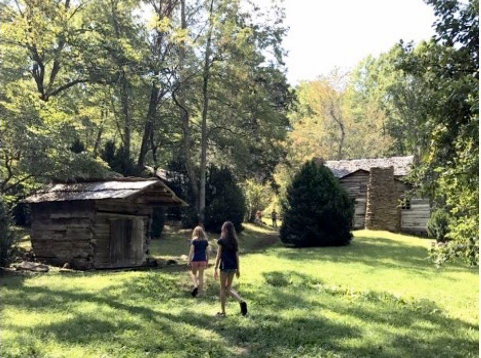
Walker Sisters Homestead

Tip: Pack a picnic to enjoy on the grounds of the cabin or return to Metcalf Bottoms Picnic Area where you can dine riverside and try to catch tadpoles and crawdads. Restrooms are available at the picnic area.