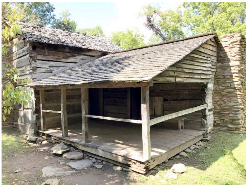
The Walker Sisters Cabin

Tip: To shorten the hike to 2.0 miles total, you can park at the Greenbrier Schoolhouse on Little Greenbrier Road (closed in the winter). The parking area is less than a half-mile up the narrow gravel road and is next to the historic Little Greenbrier School.