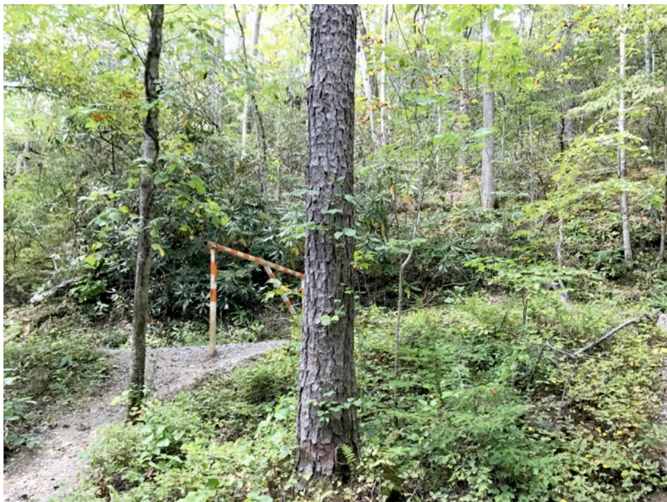
The trail to the Walker Sisters Homestead starts behind the gate going right

After visiting the school and taking turns being the teacher, you're now ready to continue to the Walker Sisters Cabin. The Little Brier Gap trail is located at the end of the gravel road that runs behind the cemetery in front of the schoolhouse. You'll see a gate crossing the gravel road and the trail begins from there.