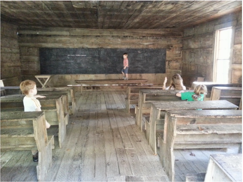
Little Greenbrier Schoolhouse

If you are here on a Tuesday, you may find a volunteer dressed as a teacher from the time period to lead classes. Otherwise, the kids will have a good time standing up front and instructing their siblings (and you).