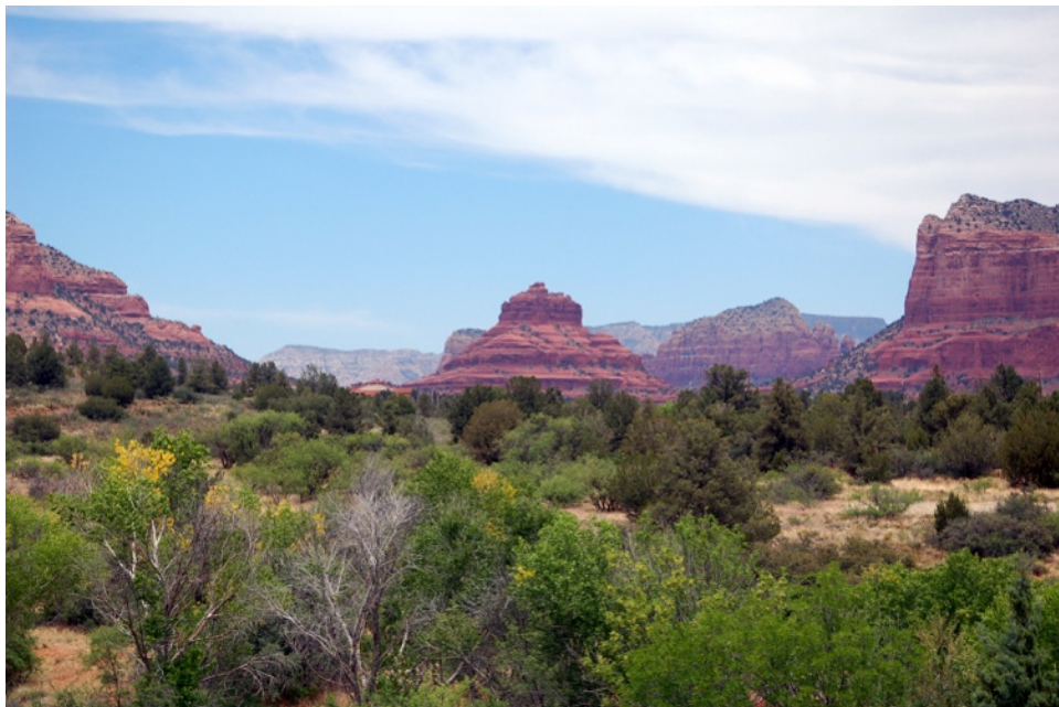
The unmistakable Bell Rock from afar

Bell Rock is an iconic red rock formation located just north of the Village of Oak Creek and is an easy one to spot. My daughters loved hiking and climbing about half way up Bell Rock to the “meditation perch.” Bell Rock is one of the most prominent Sedona vortex sites.