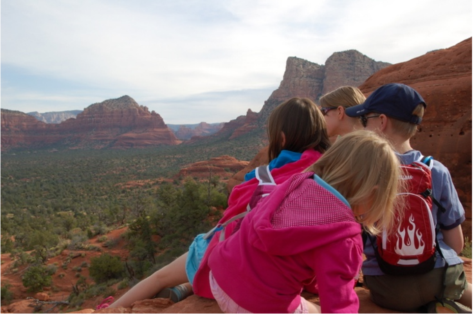
View from Meditation Perch

You can do as much or as little hiking as you'd like here- it's a fun place to hang out. Make sure you park in the north Bell Rock parking area (Courthouse Vista Parking Area)--the south side of Bell Rock is too steep to climb.